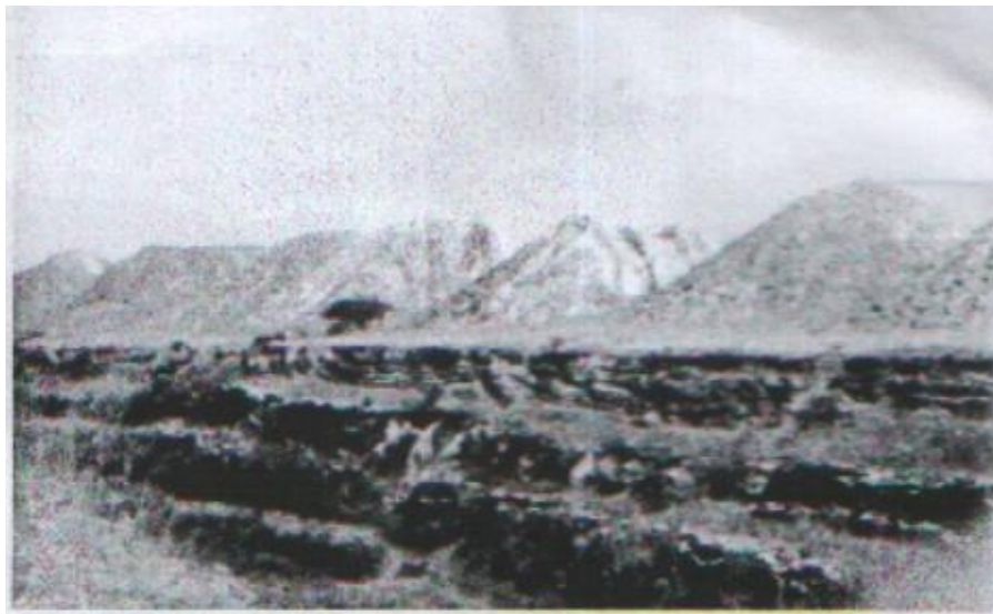
Figure 2: Heaps of Mine Spoils (Overburden) in the Study Area.

It can be observed from the results of water analysis that the tin mining activities carried out on the project area did not significantly affect its quality. The small traces of manganese, iron, and chromium observed in some samples cannot be said to be significant enough to warrant panic, except for fear of bioaccumulation. The major problem however, as observed from this study, is the several abandoned mine ponds and heaps of mine spoils that abound on the project area and are spoiling the scenic beauty as well as serving as contaminants for both humans and animals (Adiuku – Brown, 1994). Some authors (Schoeneick et al , 1998) are of the opinion that the area was left in a confused state. The several abandoned mine ponds have however, found use in irrigation, fishing, and other domestic and industrial purposes such as, laundry, bathing, and block making.