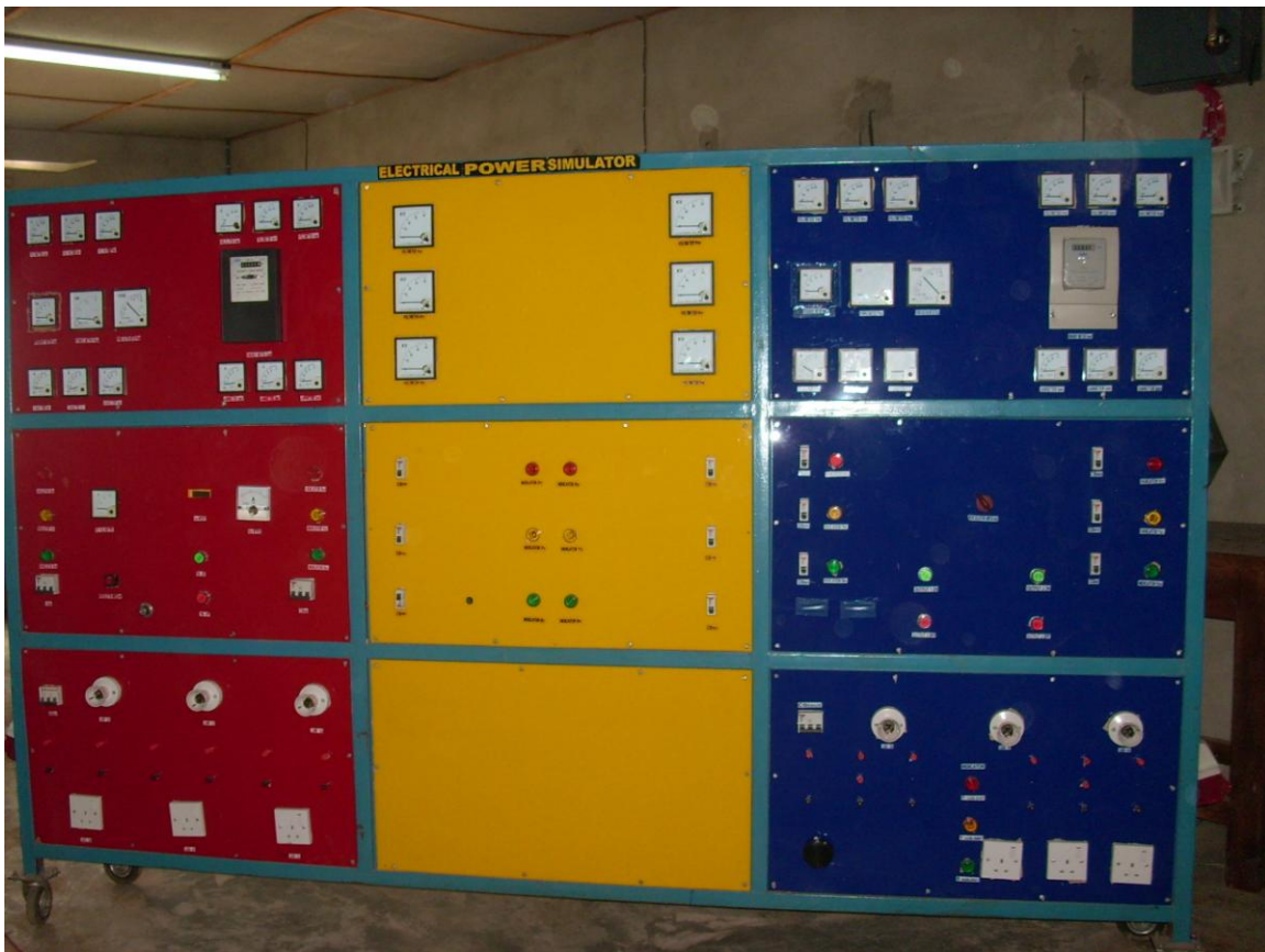
Figure 2: Power System Simulator (PSS): A Self-Contained Unit, which Simulates all Parts of the Electrical Power Network and their Protection, from Generation to Utilization points.

A switched bus bar section includes a main, bus and a standby bus. These simulate a real bus-switching system in a power plant or power distribution station. Protection relays and contact breakers monitor and switch the incoming and outgoing feeders of the busbar.